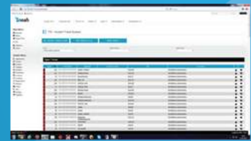
ITS - Tickets Overview